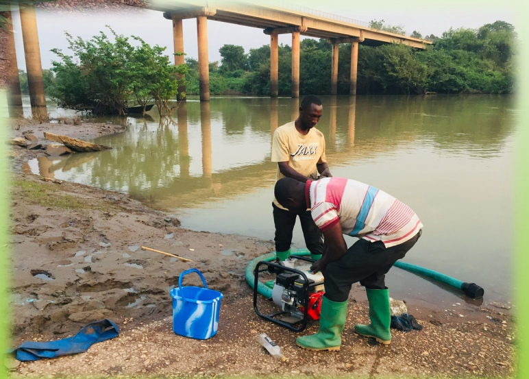
Using water from the Black Volta River for watering during the harmattan