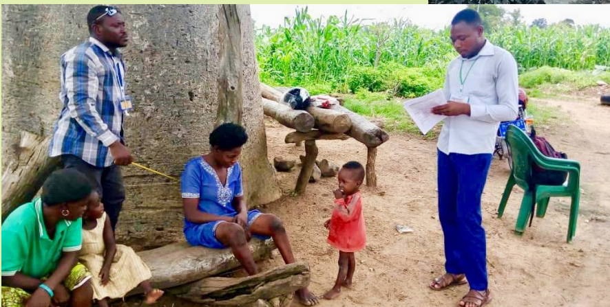
Savannah Regional data collation