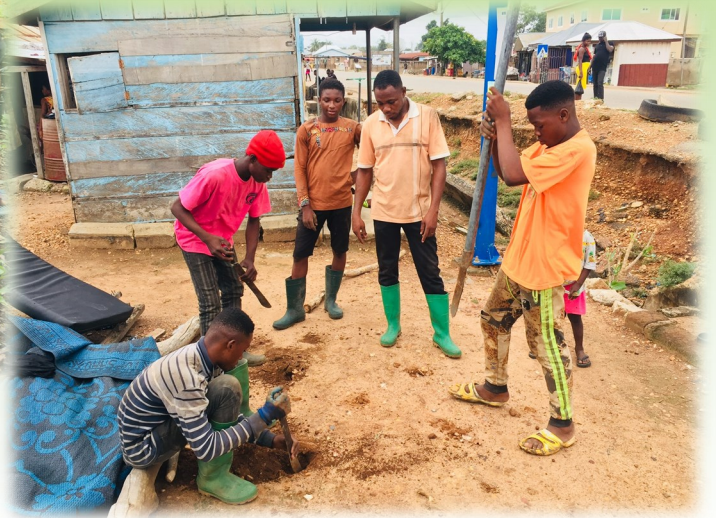
Tree planting in the Bamboi community