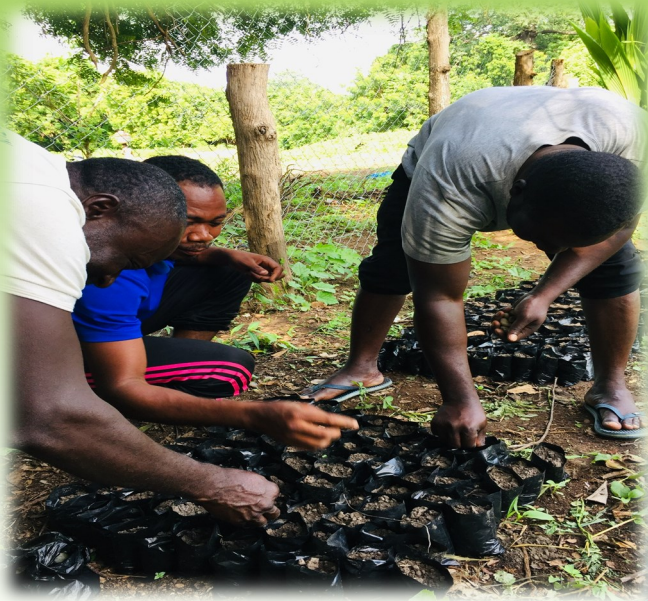
BGF - Tree Nursery