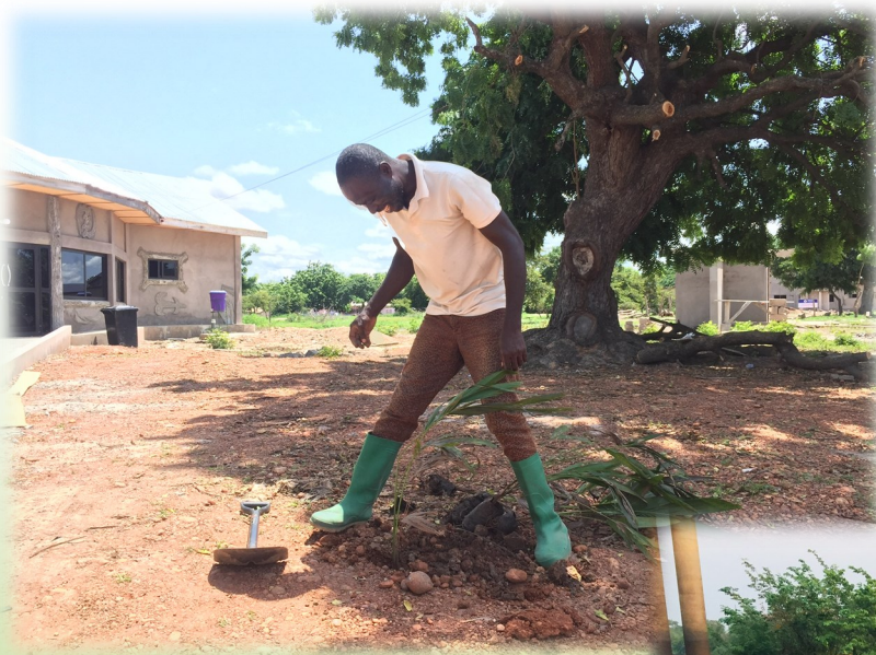
Tree Planting at the North Mo Traditional Council Forecourt