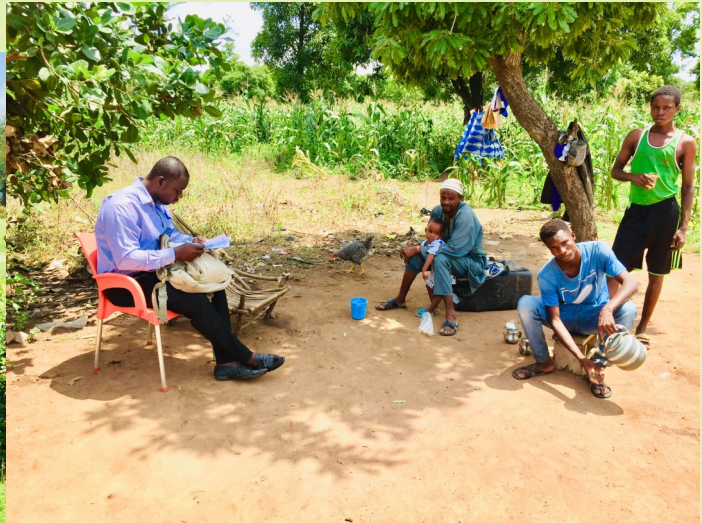
Bono Regional data collation